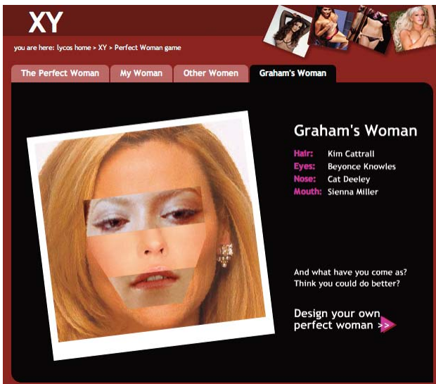
Viral landing page